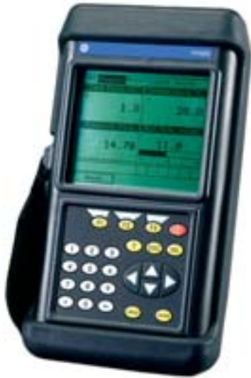
The PM880's large LCD displays moisture readings in dew point (°C or °F), ppm v , ppm w , lb/MMSCF (natural gas), and a variety of other unit options in graphic or alphanumeric formats.

Training for the PM880 is available on-site, in the factory or on line. GE offers extended warranties and service agreements for the PM880 as well as a range of services including NIST-traceable calibration, field calibration, rentals and moisture surveys.